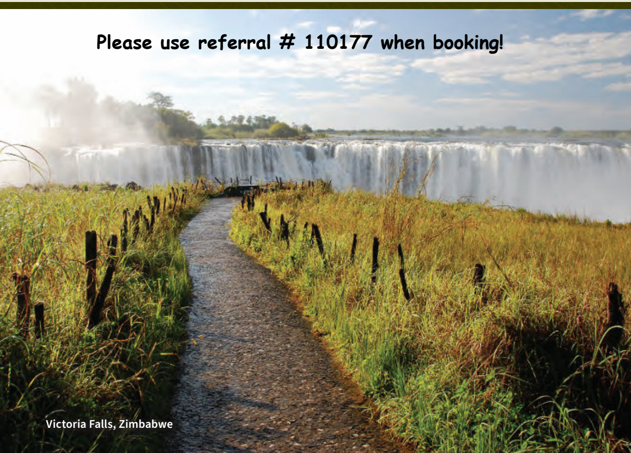
Victoria Falls, Zimbabwe

Please use referral # 110177 when booking!