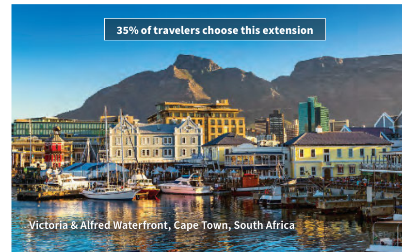
Victoria & Alfred Waterfront, Cape Town, South Africa