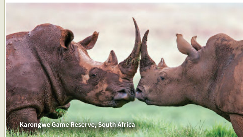
Karongwe Game Reserve, South Africa

This destination is only available as a trip extension