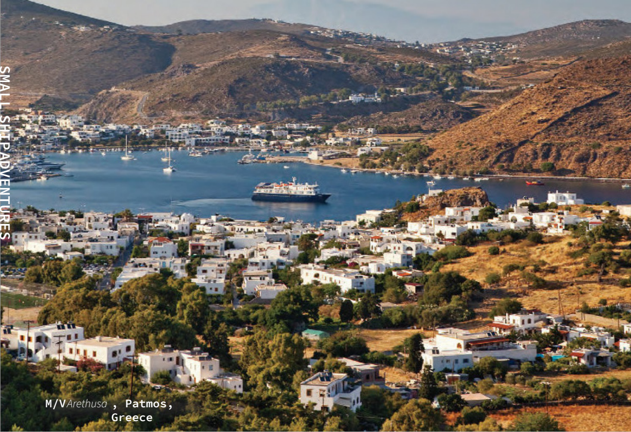
M/V Arethusa, Patmos, Greece