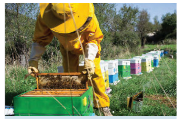
On Day 5, visit a local honey farm for A Day in the Life experience and discover Delphi's prized commodity