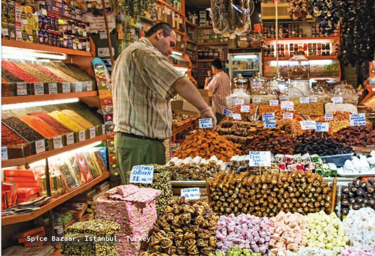
Spice Bazaar, Istanbul, Turkey